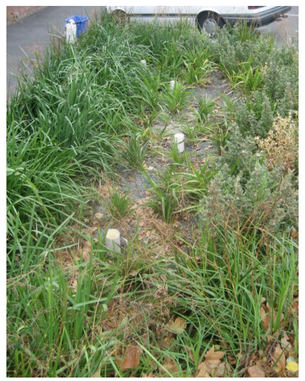
Figure 1. Spatially distributed monitoring points

For bioretention systems with a surface area less than 50 m<sup>2</sup>, in situ hydraulic conductivity testing should be conducted at three points that are spatially distributed (Figure 1). For systems with a surface area greater than 50 m<sup>2</sup>, an extra monitoring point should be added for every additional 100 m<sup>2</sup>. It is essential that the monitoring point is flat and level. Vegetation should not be included in monitoring points.